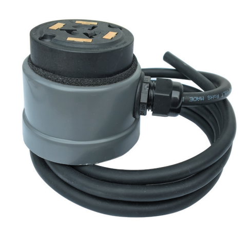
FP283 with 7-pin configuration