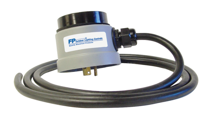
FP283 with 3-Pin configuration